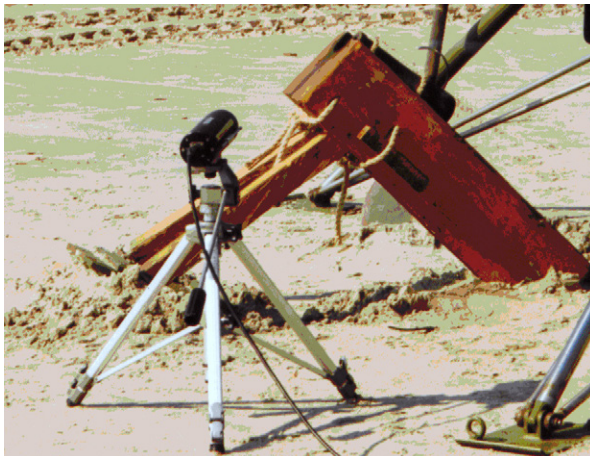
Figure 7 The gun on its bed set at 45°

The gun, set on its wooden bed, was elevated to 45° and set into the sand. The radar to measure velocity and range was set behind the gun.