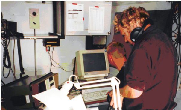
Figure 11 The radar equipment in the base vehicle

The velocity of the shot and its range were measured by radar.