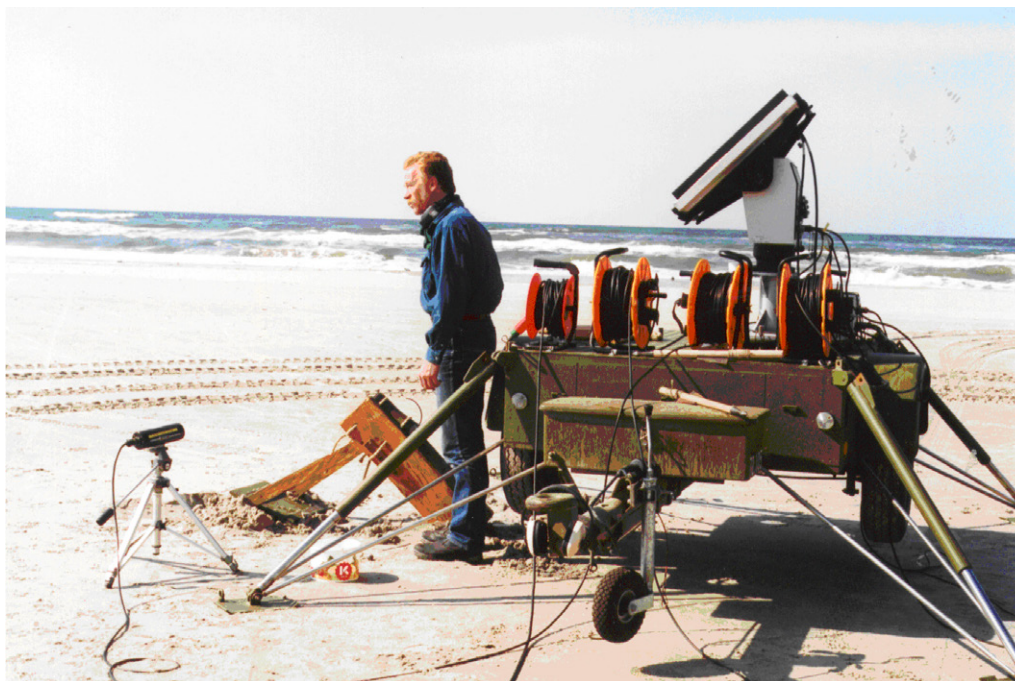
The firing trials