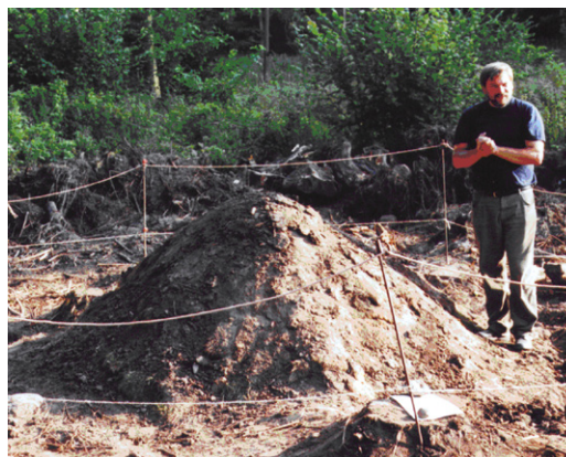
Figure 4 The charcoal heap after firing and ready for opening