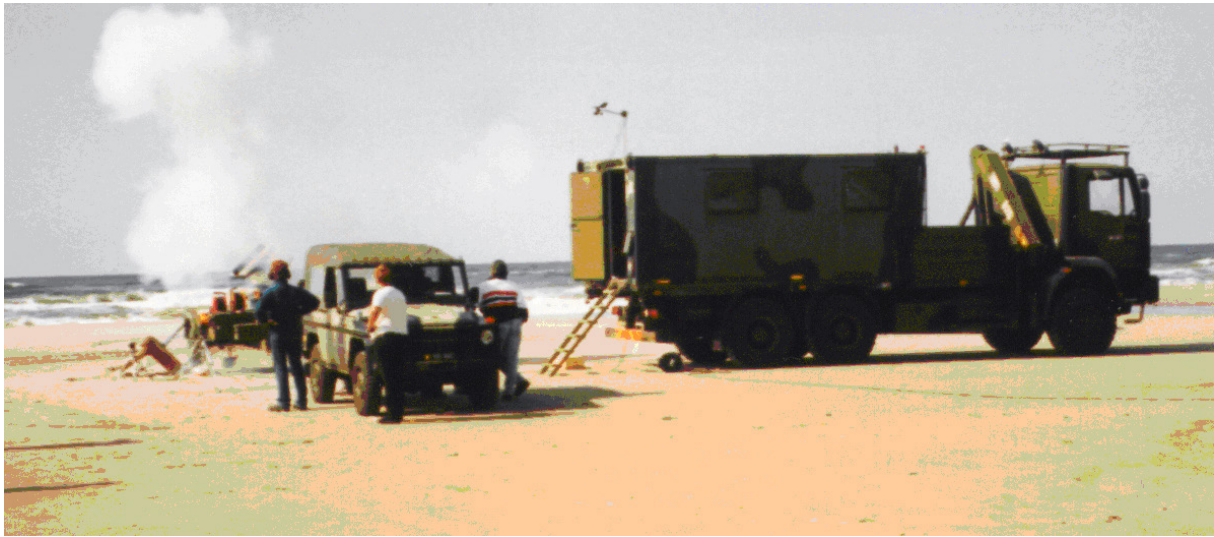
Figure 6 The test set up. The gun and radar is on the left with the radar behind it. The vehicle to the right contains the office and computer

The tests were carried out on the Danish Army testing ground at Oksbol, using a replica of the Loshult gun.