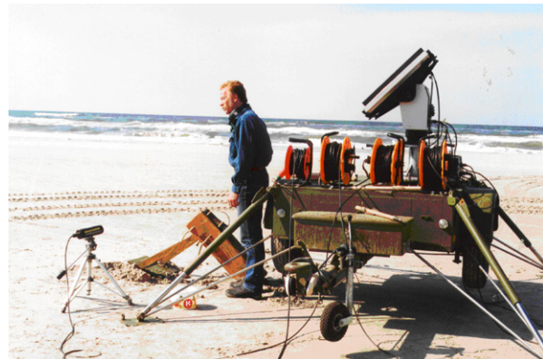
Figure 8 The gun and radar set up.

For each test the following loading procedure was carried out: