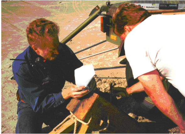
Figure 9 Loading the gun with a measured charge