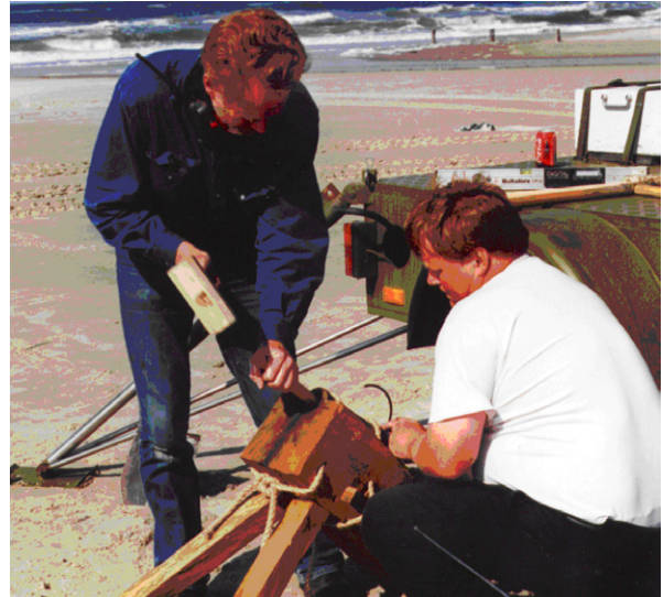
Figure 10 The ball is hammered home

The velocity of the shot and its range were measured by radar.