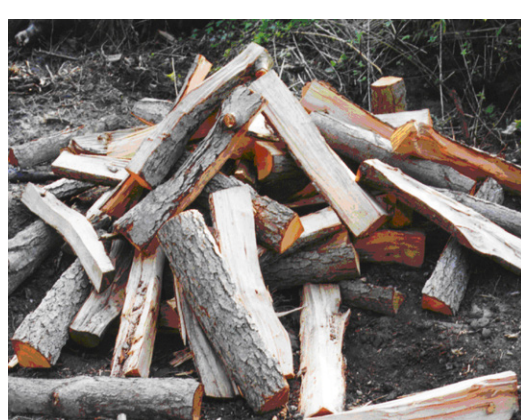
Figure 3 Alder wood cut ready for making into charcoal

Charcoal was produced at the Medieval Centre by the traditional method of burning wood without oxygen in a clamp. The wood chosen was alder.