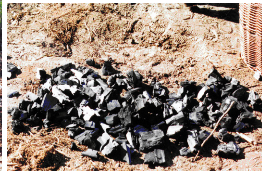
Figure 5 Charcoal selected for making gun-powder