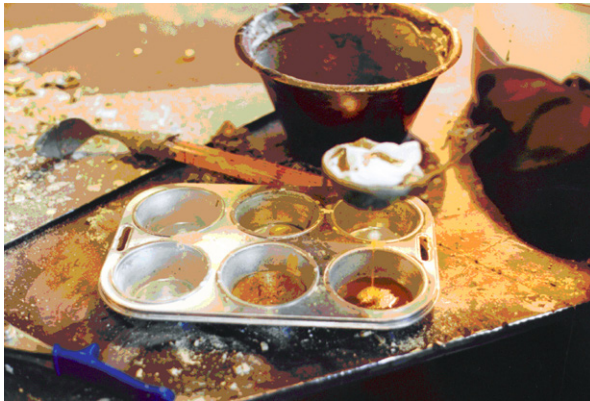
Figure 1 Pouring the molten sulphur through a cloth in a metal sieve into a mould

The raw sulphur was acquired on a visit to Iceland by Peter Vemming and Jens Christiansen in March 2002. This raw material was brought back to Denmark and purified. It was heated in an oil bath to approximately 150°C. A simple metal sieve, similar to a tea strainer, was used to skin off the scum that formed as the material melted until the resultant material appeared to be clean. The molten sulphur was then poured through a cloth held in a metal sieve into a small mould approximately 70 mm in diameter. When first cast the sulphur appeared a dark lustrous yellow. With time this changed to a dull paler yellow colour.