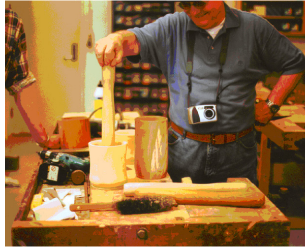
Figure 2 The mortars and pestles used to prepare the powder

Once refined, the sulphur was prepared for making the powder by first breaking up the cakes. They were placed between two layers of cloth and hammered on an anvil to break them into smaller pieces ready for the mortar. The small pieces were then ground up to a fine powder in the wooden mortar using a wooden pestle. The resultant powder was finally sieved.