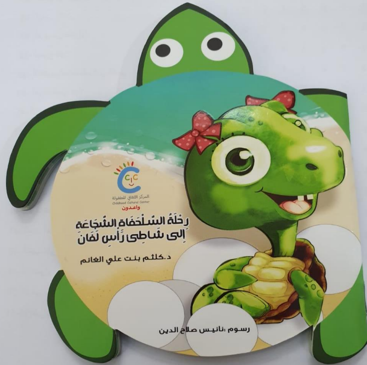
The brave turtle