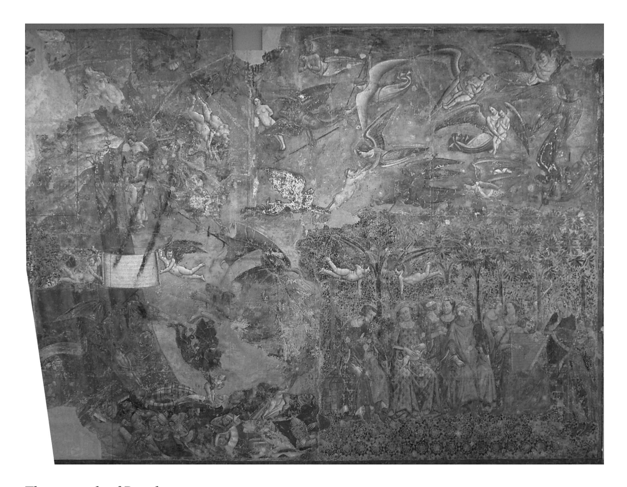
The triumph of Death.

The fresco has to be read as a meditation on death, that triumphs on every one, never mind his social status. The courtly form of life, represented by the young brigade in the garden on the bottom right, is destined to be overcome by the plague.